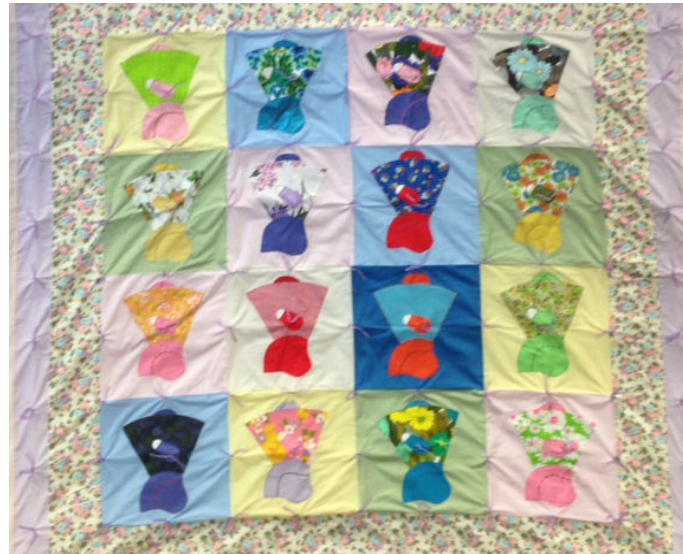
This Sunbonnet Sue quilt will be displayed in the narthex and put up for silent auction bids at the Lutenfisk Supper

Participants in the Thrivent Financial Matching Gift Program